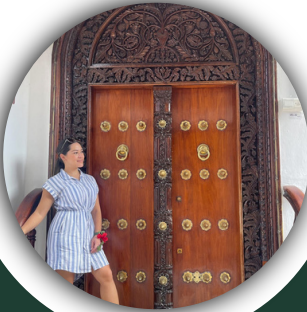
ZANZIBAR BEACH HOLIDAY